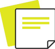
Backup & Support