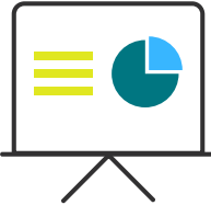
Data & Analytics